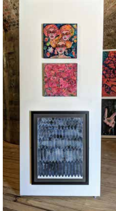
Exhibitions □ Round Tower